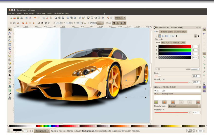
Figure: Gilles Pinard